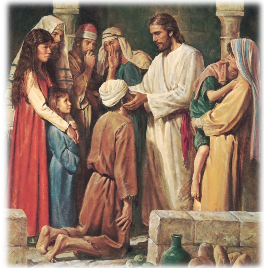
John 9:11 He answered and said, A man that is called Jesus made clay, and anointed mine eyes, and said unto me, Go to the pool of Siloam, and wash: and I went and washed, and I received sight.